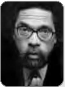
Dr. Cornel West Author and Princeton University Professor