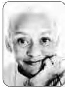
Yolande Cornelia “Nikki” Giovanni Jr. Writer, Educator, and Activist

Prior to his professorship at Princeton University, Dr. Cornel West held positions at Union Theological Seminary, Yale University, Harvard University, and the University of Paris. One of America’s most gifted and provocative public intellectuals, West has written numerous books, including Democracy Matters , Race Matters , The American Evasion of Philosophy , and The Cornel West Reader . His Beyond Eurocentrism and Multiculturalism (Volumes 1 and 2) won the American Book Award. His latest project is Street Knowledge , a spoken-word compilation CD. West is also a guest lecturer at colleges and universities across the country.