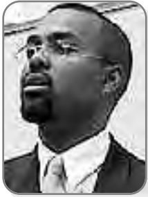
Dr. Eddie S. Glaude Jr. Associate Professor of Religion, Princeton University

Eddie S. Glaude Jr. is associate professor of Religion and Acting Director of the Program in African American Studies at Princeton University. He is also editor of Is it Nation Time? Contemporary Essays on Black Power and Black Nationalism and co-editor of African American Religious Thought: An Anthology . He is the author of Exodus! Religion, Race, and Nation in Early 19th Century Black America . Glaude received his BA from Morehouse College and his MA and Ph.D. from Princeton University.