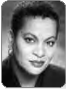
Julianne Malveaux, Ph.D. President and CEO, Last Word Productions, Inc.

Dr. Julianne Malveaux, an economist, author, and commentator, is the president and CEO of Last Word Productions, Inc., a multimedia production company. Recognized for her provocative, progressive, and insightful observations, Malveaux has helped shape public opinion in 21st-century America with her contributions to the public dialogue on issues such as race, culture, gender, and their economic counterparts. As a writer and columnist, her work appears regularly in USA Today , Black Issues in Higher Education , Ms. magazine , Essence , and The Progressive . A committed activist and civic leader, Malveaux serves on several boards including the Economic Policy Institute, the National Committee for Responsive Philanthropy, and Women Building for the Future—Future PAC. Malveaux holds BA and MA degrees in economics from Boston College and a PhD in economics from MIT.