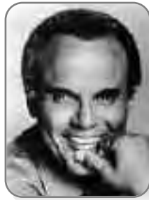
Harry Belafonte Actor, Musician, Producer, and Activist