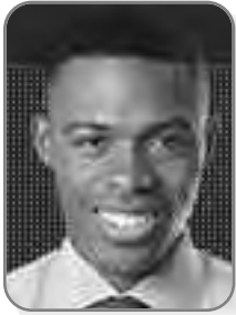
Dr. Ian Smith Medical Doctor and Author

Dr. Ian Smith is a medical contributor to ABC’s nationally syndicated The View , a medical columnist for Men’s Health magazine, and a medical/diet expert on VH1’s Celebrity Fit Club . Smith graduated from Harvard College with a BA and received his MS from Columbia University. He attended Dartmouth Medical School and completed the last two years of his medical education and graduated from the University of Chicago Prizker School of Medicine. Smith is also the author of four books, including his most recent release, The Fat Smash Diet .