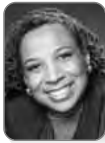
Kimberle Williams Crenshaw Professor, UCLA Law School and Columbia University

The Nation of Islam under the leadership of Louis Farrakhan is the catalyst for the growth and development of Islam in America. In 1955, Farrakhan, born Louis Eugene Walcott, left a successful career in music to dedicate his life to the teachings of the Honorable Elijah Muhammad. Rising to the rank of minister, Farrakhan led Temple No. 11 in Boston, building it into one of the strongest temples in the Nation. In 1965, following the death of Malcolm X, Farrakhan was appointed to lead Temple No. 7 in New York City. More recently, Farrakhan and the Nation of Islam organized the successful Million Man March. Farrakhan continues to lecture across the country and around the world, sharing pulpits with Christian ministers and being received by many heads of state including South African President Nelson Mandela.