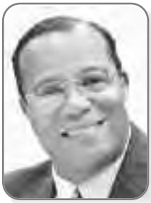
The Honorable Minister Louis Farrakhan Nation of Islam

Harry Belafonte's legendary career traverses theater, music, television and film. As an activist, Belafonte was first appointed by President Kennedy as cultural advisor for the Peace Corps. Disturbed by cruel events unfolding in Africa because of war, famine and drought, Belafonte set in motion the wheels that led to "We Are the World" on January 28, 1985. In 1987, Belafonte accepted the appointment as UNICEF Goodwill Ambassador. Later, Belafonte was the first recipient of the Nelson Mandela Courage Award and was honored at the White House with the 1994 National Medal of Arts. Belafonte continues to devote himself globally to civil and human rights issues.