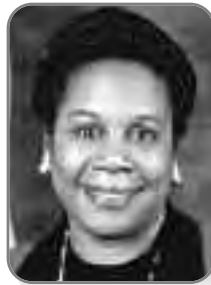
U.S. Representative Sheila Jackson Lee D-TX