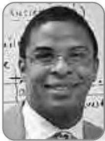
Dr. Roland Gerhard Fryer Jr.

Walter Mosley is the author of 24 critically acclaimed books. Two movies have been made from his work, including the 1995 TriStar release of Devil in A Blue Dress . He has won numerous awards including the Anisfield Wolf Award, an honor given to works that increase the appreciation and understanding of race in America, and The Sundance Institute “Risktaker Award.” With City College of New York, Mosley created a new publishing degree program aimed at young urban residents. He serves on the boards of the Full Frame Documentary Film Festival, The Poetry Society of America, and TransAfrica.