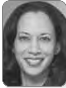
Kamala D. Harris San Francisco District Attorney