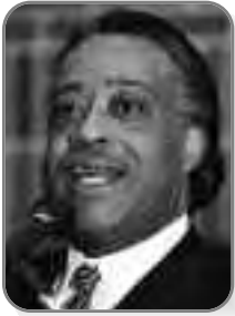
Reverend Al Sharpton Civil Right Activist Founder and President, National Action Network

Reverend Al Sharpton is one of America's foremost leaders on civil rights. For more than two decades he has played a major role in virtually every significant movement for civil liberty, community empowerment, and economic equality. As founder and president of the National Action Network, Sharpton heads an organization that fights for progressive people-based policies against the rising conservative trend. Joined by former New York City Mayor Ed Koch and Harvard law professor Charles Ogletree, he formed "Second Chance," a program for nonviolent felony offenders who have served their prison sentences. The story of Sharpton's career is recounted in his autobiography, Go and Tell Pharaoh .